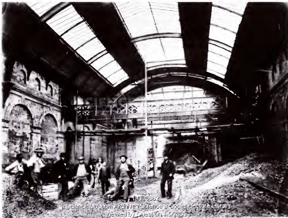
Constructing Paddington (Praed Street) Station, London, 1866-8. Picture Reference: 10325362