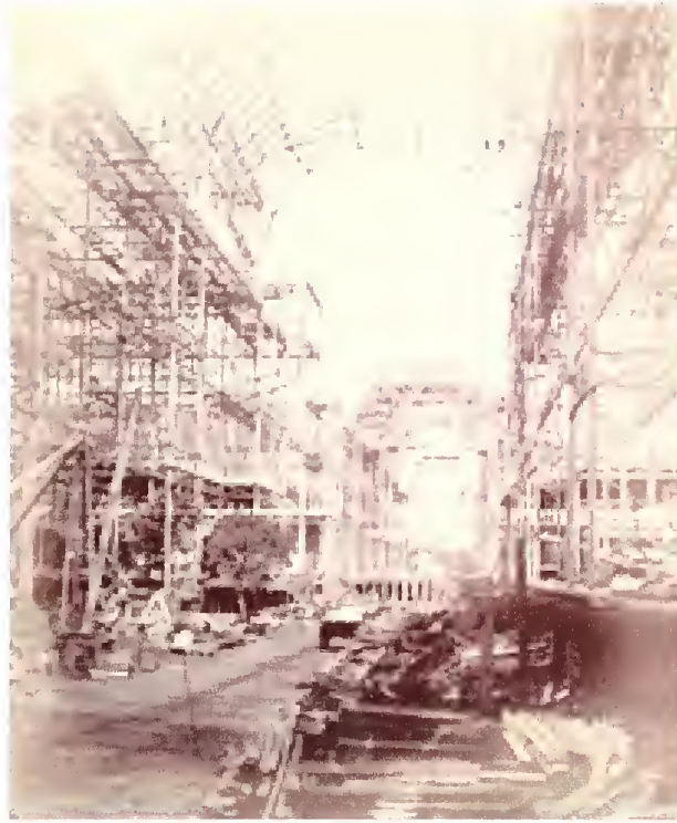
Delamotte, Philip Henry. "The Nave Looking North." 1855. The Photographic Institution; London, England. "Construction work in progress on the nave of the reconstructed Crystal Palace exhibition hall at Sydenham Hill" (< http://www.collectbritain.co.uk/personalisation/object.cfm >